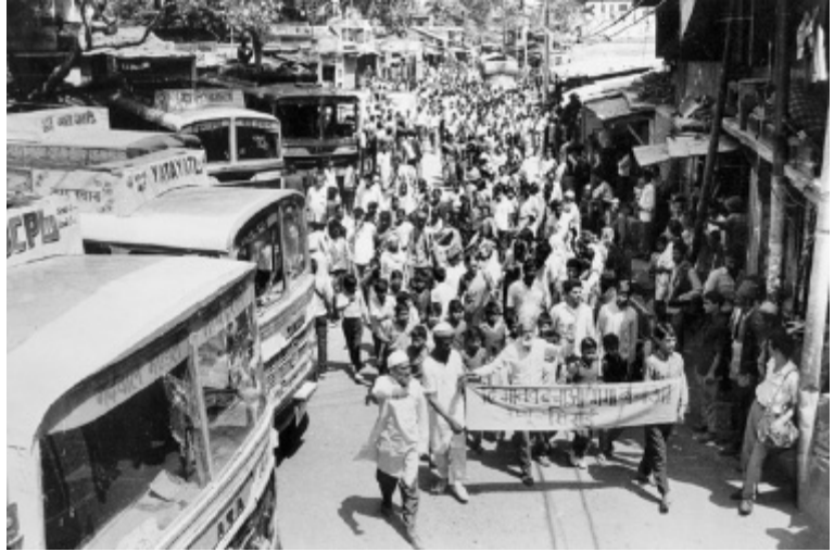
Anti-dam protest in Tehri Town

The project was abandoned in the mid 1980s after being sharply criticized on environmental grounds by a government appointed review committee.