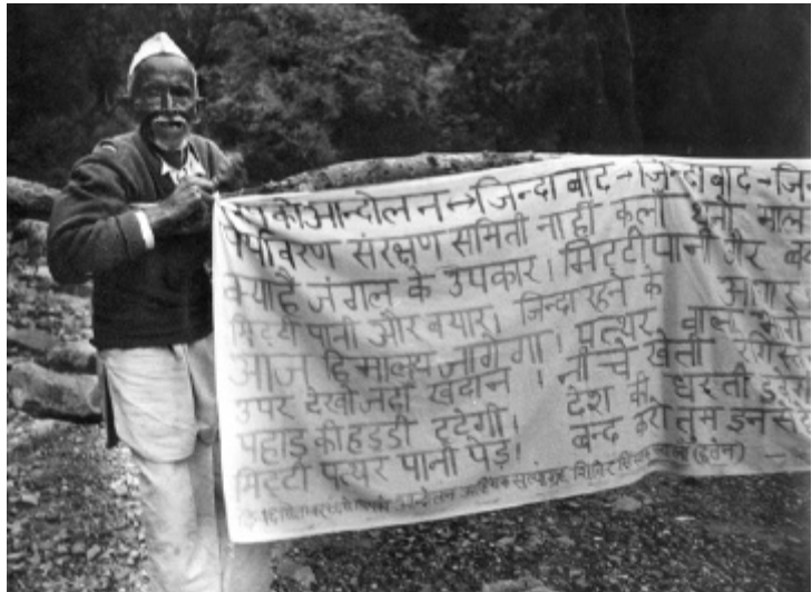
Protester with anti-Tehri Dam slogans