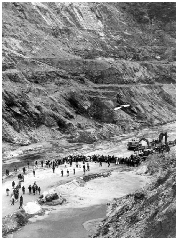
Protestors block equipment at dam site

Among those officially recognised, only half of the fully affected, and very few of the partially affected families have been resettled. In most cases the land allotted is of poor quality or with multiple ownership claims.